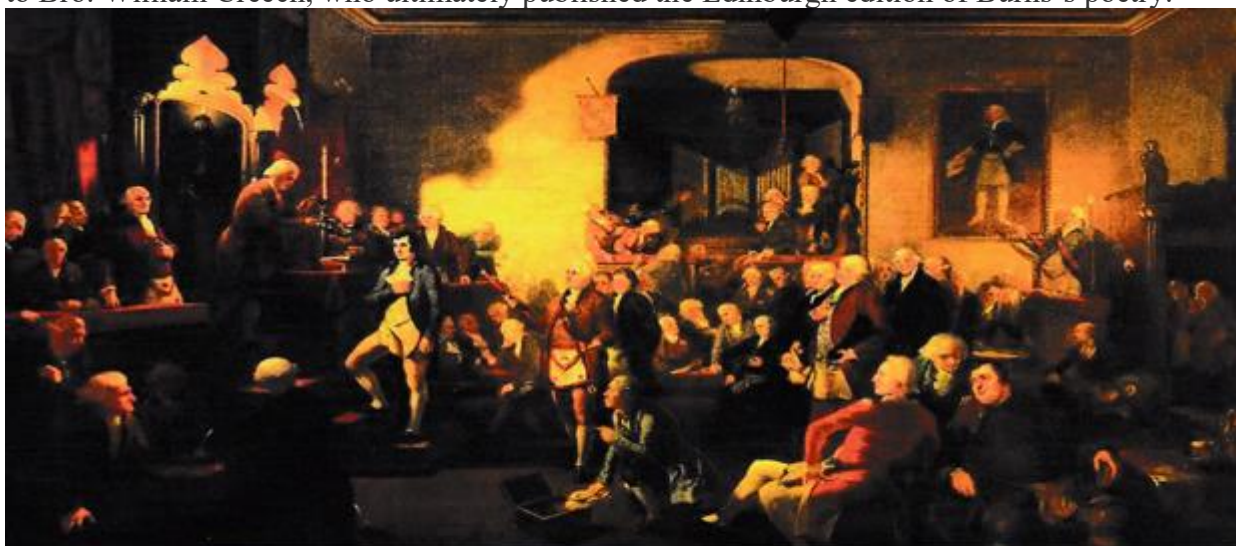
Fig.6: The Inauguration of Robert Burns as Poet Laureate of The Lodge Canongate Kilwinning – Edinburgh, 1 st March, 1787 By Stewart Watson 1846

he met many of the nobility and the great and the good in Scottish society. Amongst these was Bro. James, the Earl of Glencairn who became a great champion for Burns. He introduced him to Bro. William Creech, who ultimately published the Edinburgh edition of Burns's poetry.