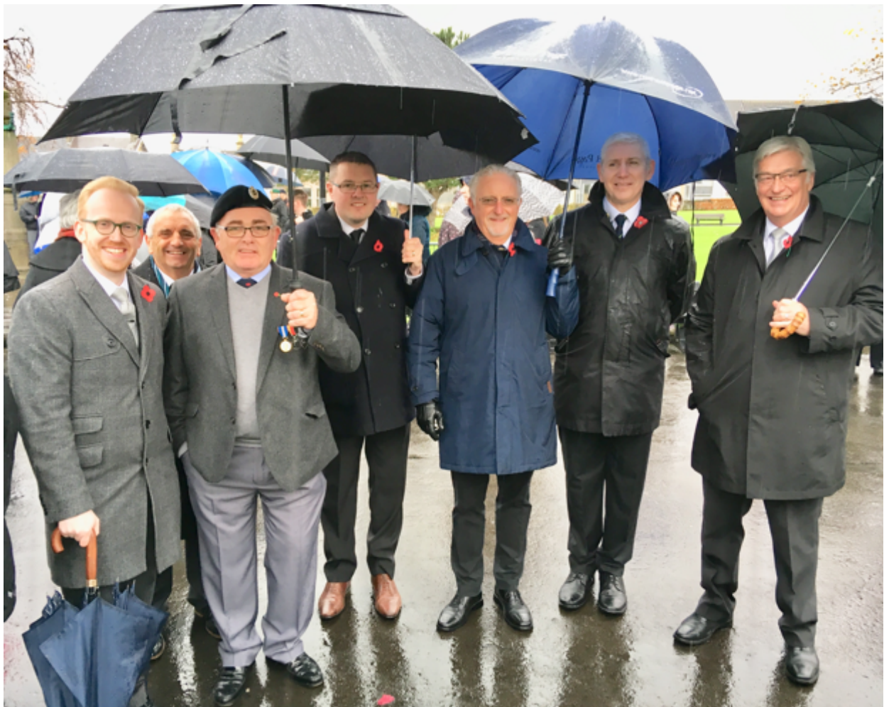
Masonic Brethren at the Cenotaph despite the inclement weather