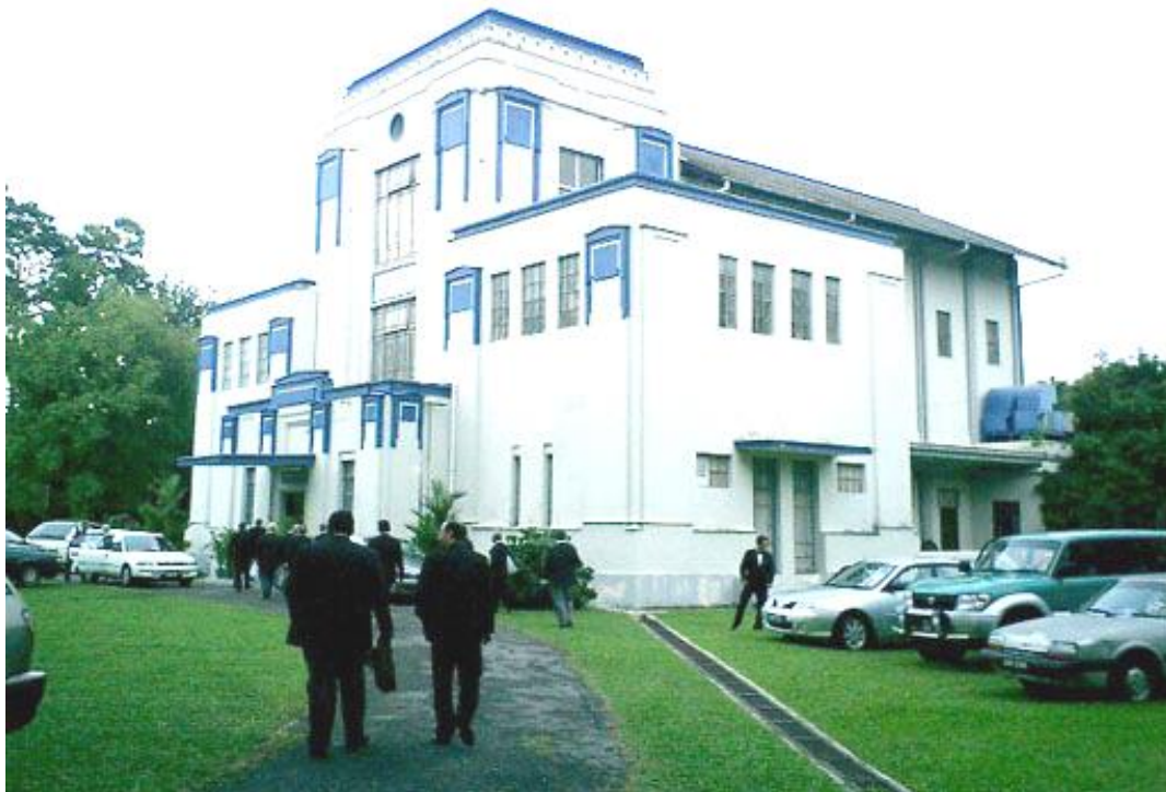
Freemasons Hall, Penang

Once, part of the Empire. Penang has many reminders of colonial presence which include Farquhar, Campbell, Argyll and Downing Streets, the Cameron Highlands with Bukit (Hill) Fraser, a monument to Queen Victoria, and the ubiquitous funicular railway that to this day still takes the ex-pats to the cool of a hill station.