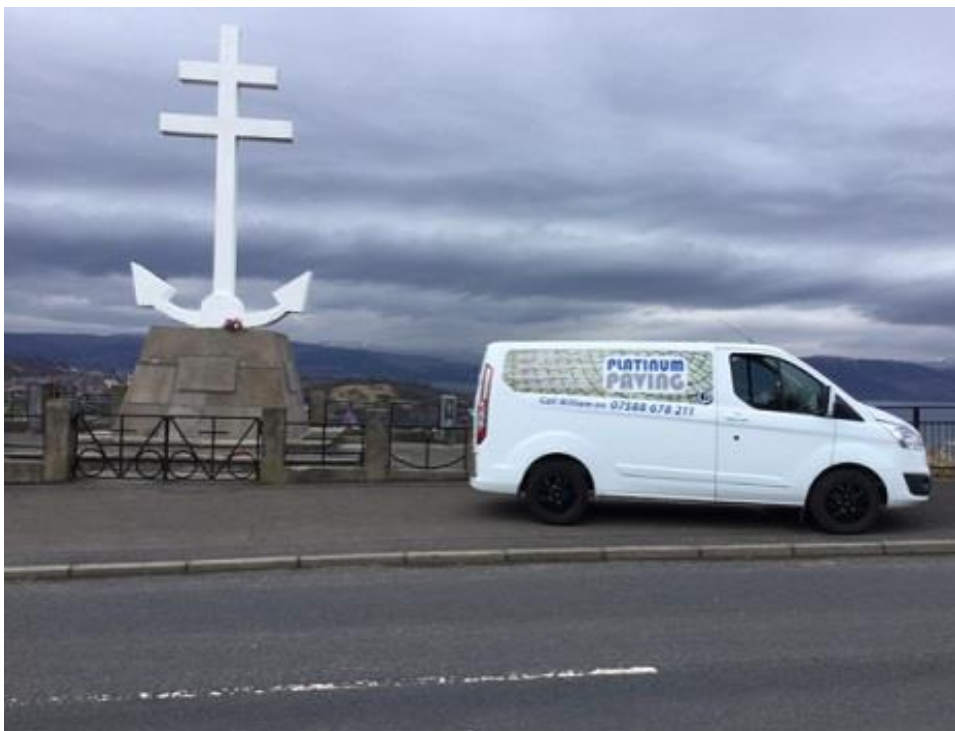
Platinum Paving. Brother William Peacock (Lodge Inverkip Ardgowan No. 1425).

I am always delighted to include any adverts for companies and services operated by our members and there are some additional new adverts included in this month's Column.