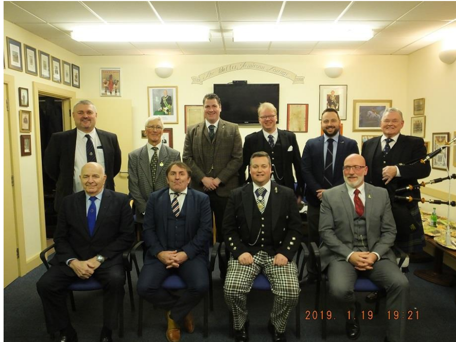
The line-up of artistes and stewards before the evening got fully underway

The annual Burns Supper at Lodge Firth of Clyde, Gourock No. 626 was held on Saturday 19 th January in a hall filled to capacity and serving up its usual fine offering of excellent food, company, songs, readings and speeches.