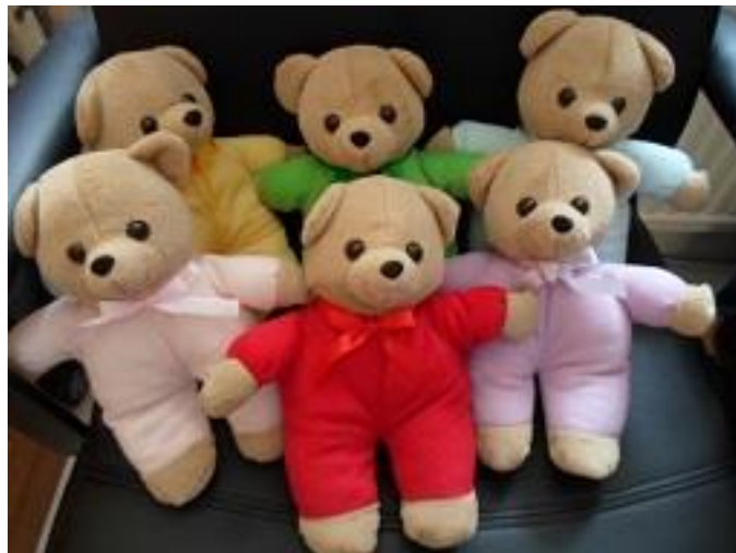
Not Broxi Bears but TLC bears - part of the first delivery to IRH.

If you would like to know more about the TLC project go to http://www.tlcappeal.org/