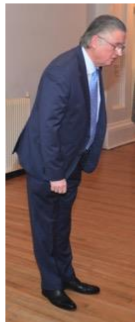
The Haggis demands admission