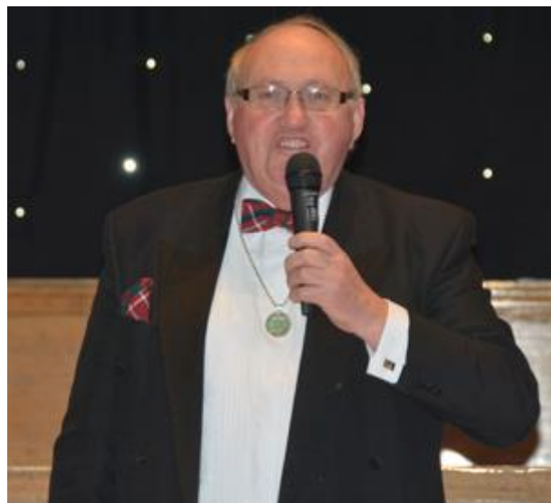
Depute Provost's Address