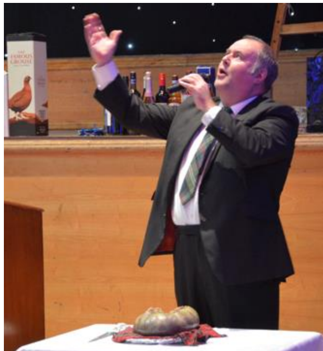
Ye Pow'rs wha mak mankind your care