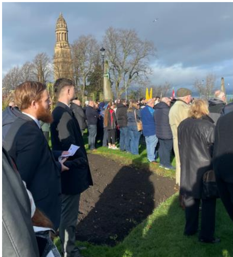
Part of the No. XII 'Deputation' at Well Park