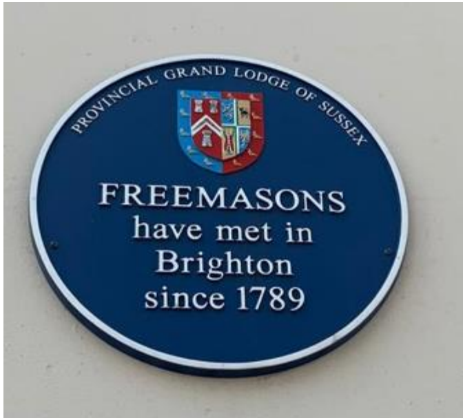
Brighton, Sussex – Bros. Cameron (in photo) and Iain White