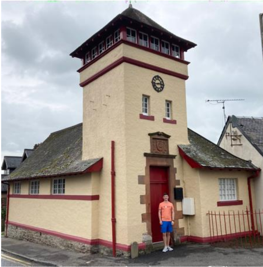
Lodge Blairhoyle No. 792 Thornhill, Stirlingshire, Province of Perthshire West Bros. Cameron (in photo) and Iain White