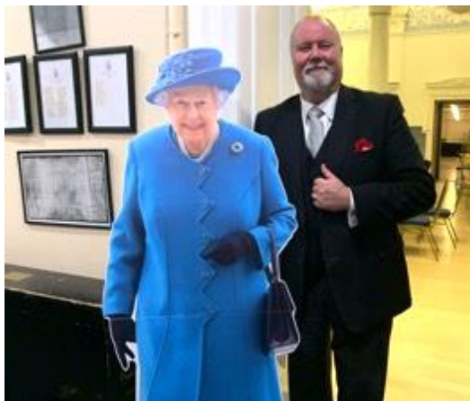
Our special guest for the evening!