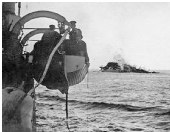
Lancastria sinking off St. Nazaire