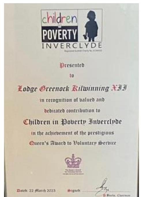
The Certificate presented to No. XII by Children in Poverty Inverclyde (right)