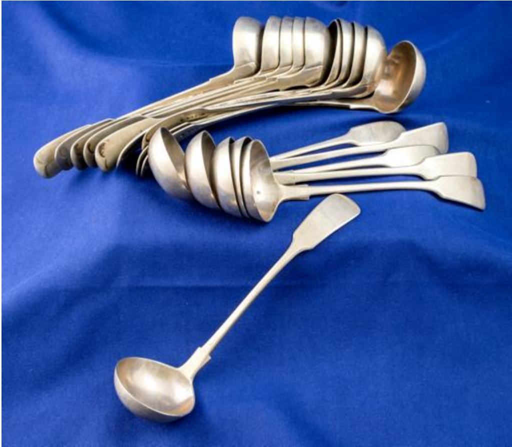
Silver Punch Ladles