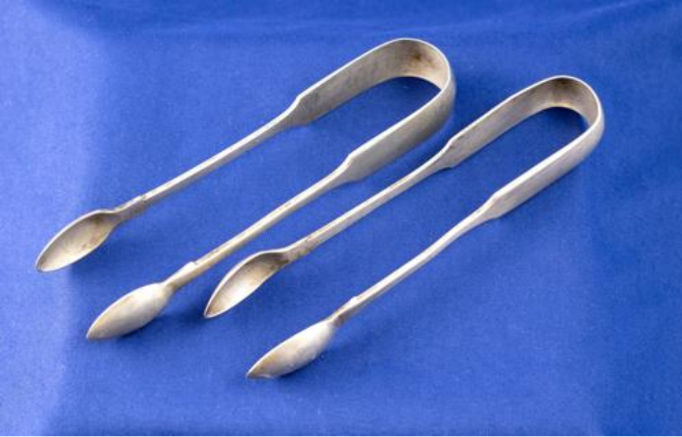
Silver Sugar Tongs

We are lucky as a Lodge to have so many links to the past through our artefacts and whilst few are of any monetary value, they mean a lot to the Lodge and to Freemasonry in general terms.