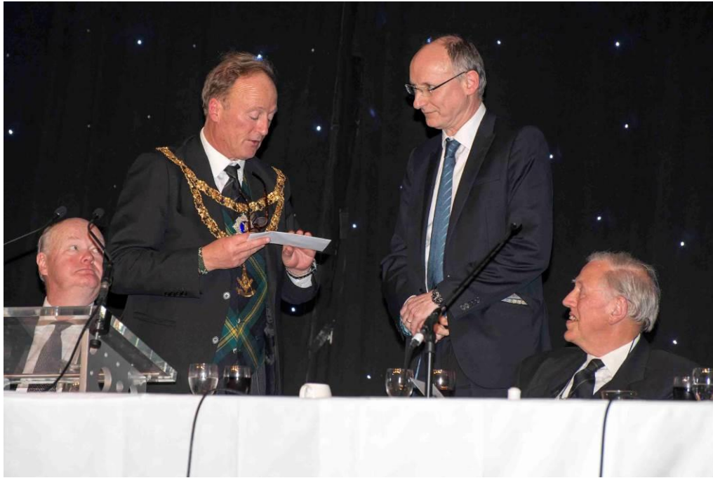
Most Worshipful Grand Master presenting a cheque for £10,000 in aid of Prostate Cancer Scotland.

A sumptuous meal with excellent entertainment followed with the following toasts being proposed and responses received: